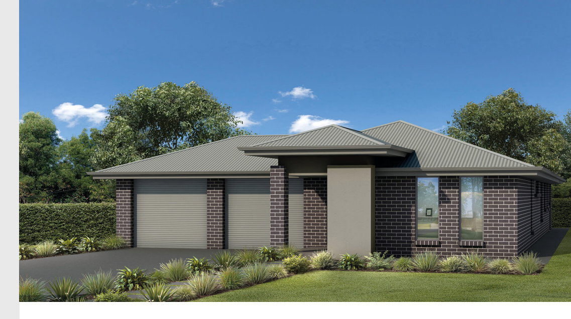
□ 4 □ 1 ← 2 ← 2

House Size 202m<sup>2</sup> / 21.75sqs Width 11.50m